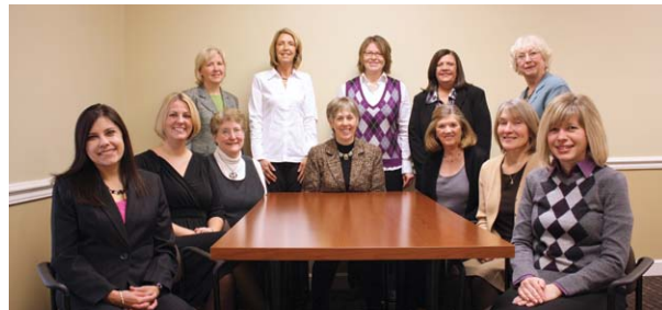
Our Mission: To count. To count in the lives of our clients and employees. To count in our community.